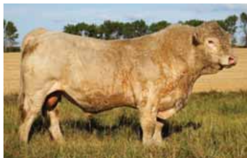
SPARROWS ESCOBAR 429B