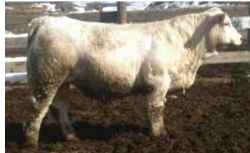
RR CUTTING EDGE 6020