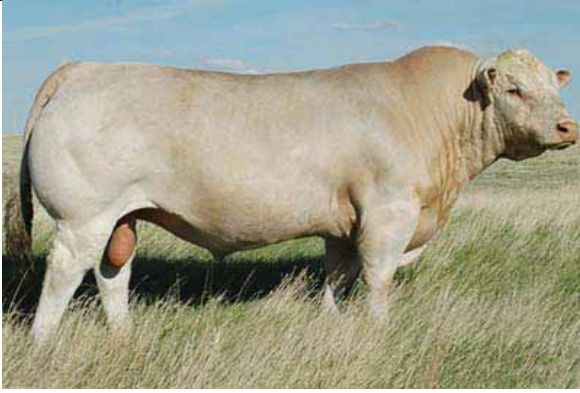
LT LEDGER 0332 P