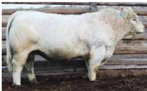
NGC LENDER 404B ET