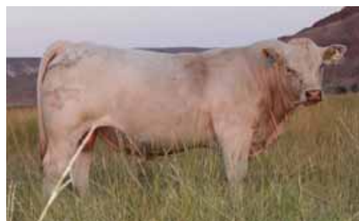
RR ZOTTO 3152