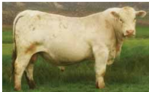
CARDINAL'S LAD 6157P