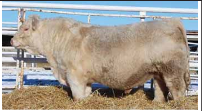
Sparrows Escobar 429B

Nice calf with some added eye appeal and middle.