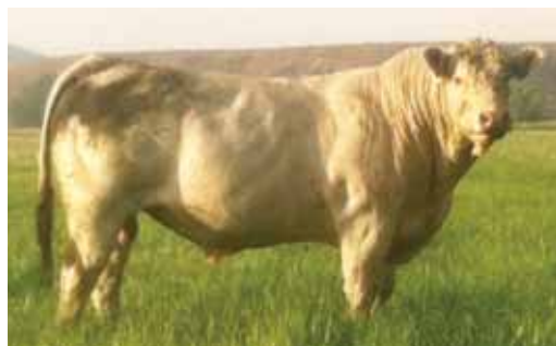
RR LEDGER GRIZZ 4008