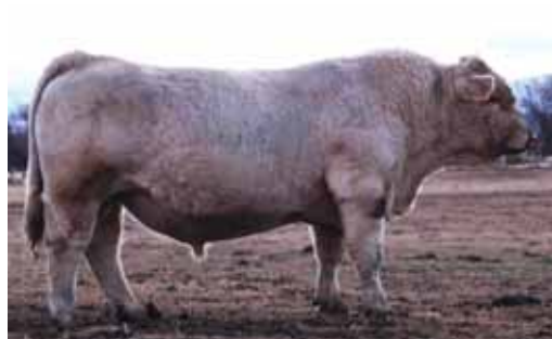
ABC CALIENTE C822 POLL