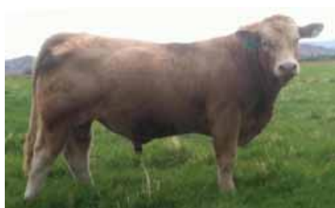
RR RED OVER TIME 502