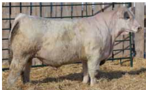
TR MR SUBSTANCE 512